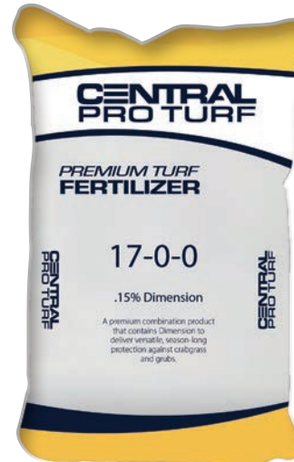
PROTURF FERTILIZER WITH DIMENSION