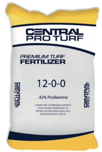
PROTURF FERTILIZER WITH PRODIAMINE